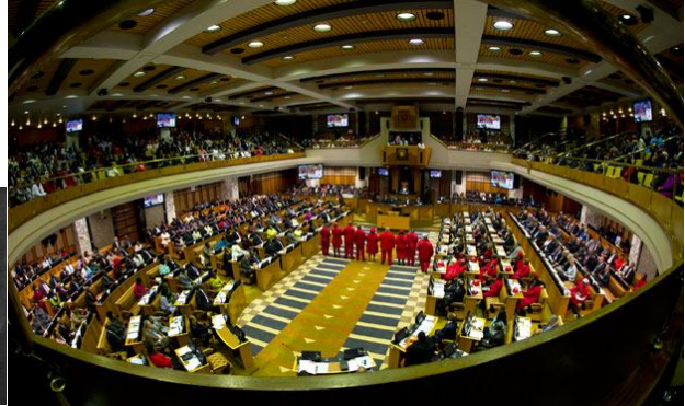
RSA Cabinet with 35 Ministers and 37 Deputy Ministers