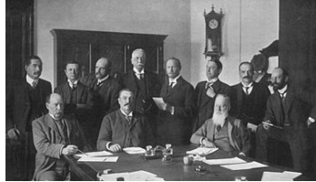
The Union Cabinet in 1910